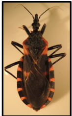
A kissing bug

The parasite Trypanosoma cruzi is carried by kissing bugs, especially in their feces. Kissing bugs feed on blood and are usually active at night.