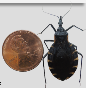
Triatoma gerstaeckeri Kissing bug adult female

Please write down exactly where the bug was found, what the bug was doing (flying, walking, etc.), and the date/time.