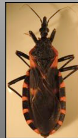
Adult female Triatoma sanguisuga