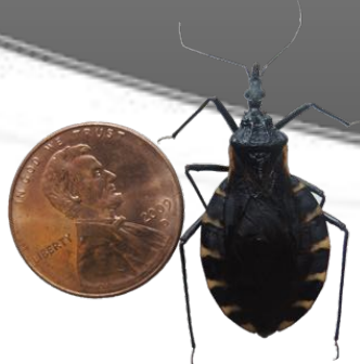
Triatoma gerstaeckeri Adult female