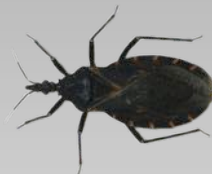
Triatoma indictiva Adult female

The parasite initially causes a localized reaction, but the parasite can later affect the heart and digestive tract, and can ultimately cause Chagas disease and death. No vaccines exist, and medications are few and not always effective.